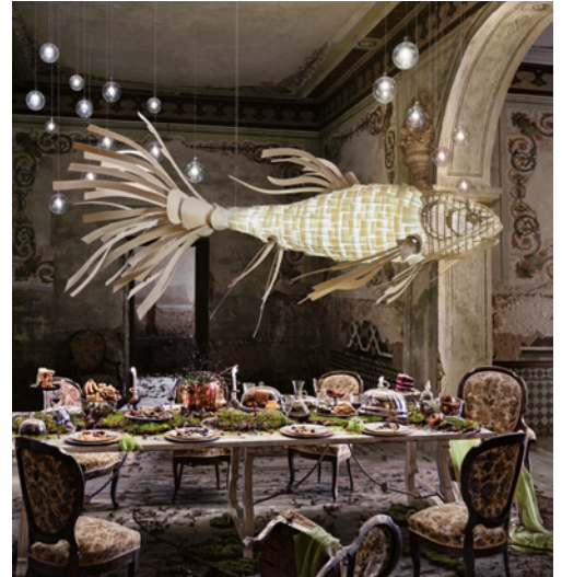
REF. KOI LS CLUSTER LED 20 Koi